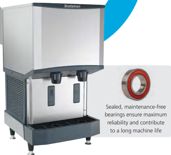
HID525A-1 with optional KLP24A legs

Sealed, maintenance-free bearings ensure maximum reliability and contribute to a long machine life